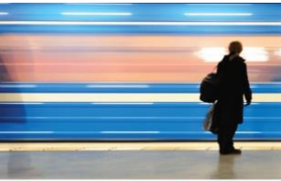
AN IGNATIAN PRAYER ADVENTURE

We're excited to kick things off with our first dinner in February! Can't wait to eat and connect with you all! Bon Appétit! 😊